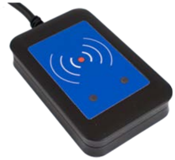
Desktop version (inlay customizable)

Elatec's TWN4 family of transponder readers and writers allows users to read and write to almost any 125 kHz, 134.2 kHz and 13.56 MHz tags and/or labels. It supports all major transponders from various suppliers like ATMEL, EM, ST, NXP, TI, HID etc. and ISO standards like ISO14443A/B (T=CL), ISO15693, ISO18092 / ECMA-340 (NFC).